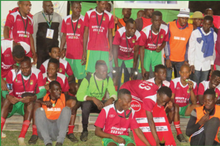
Mninginisi Gezani United celebrate after winning the Mayor's Cup tournament in the male soccer category