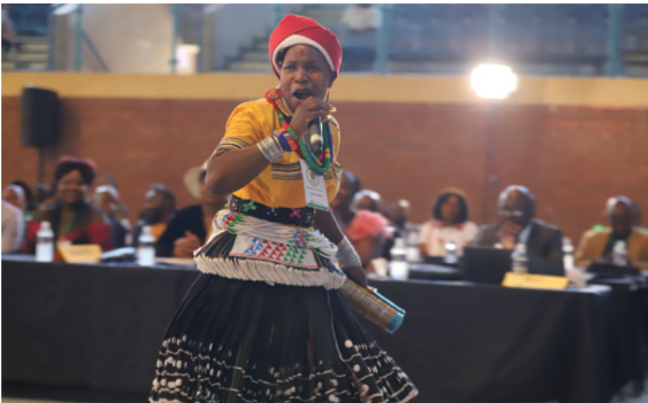
A poet known by her stage name "N'wajika" performs during a budget sitting at Giyani Community hall

A budget of R4,1M will be allocated to each village for electrification.