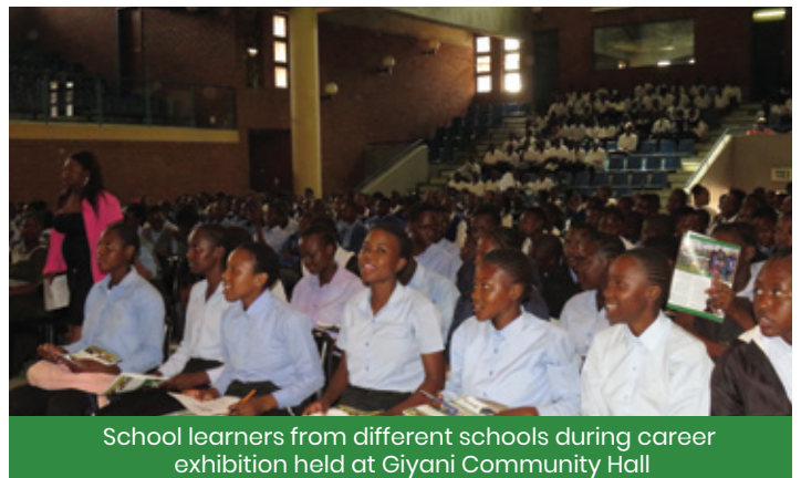
School learners from different schools during career exhibition held at Giyani Community Hall