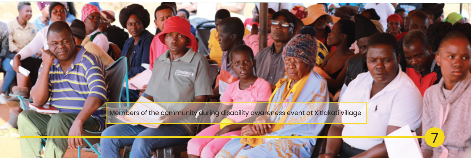
Members of the community during disability awareness event at Xitlakati village

She said there were at least two people living with a disability for every ten people employed by EPWP unit. She said some were full time municipality employees.