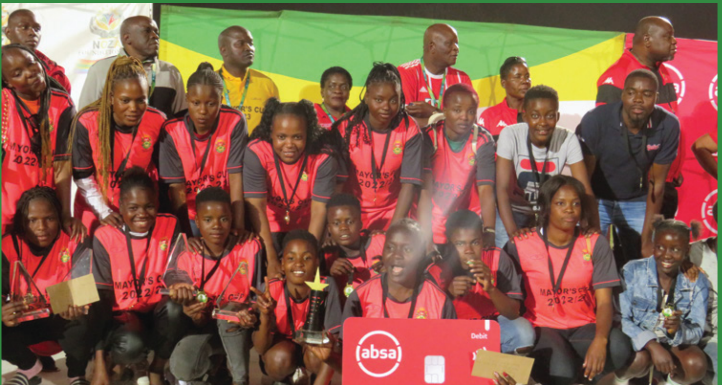
Real Mighty FC celebrates after winning the mayor's cup tournament in the female soccer category